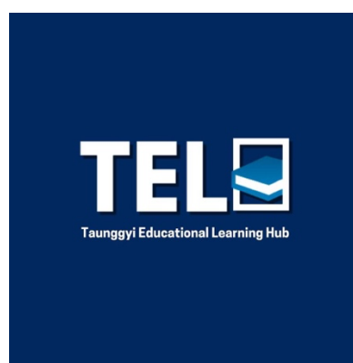
Taunggyi Educational Learning Hub